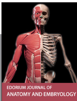
EDORIUM JOURNAL OF ANATOMY AND EMBRYOLOGY