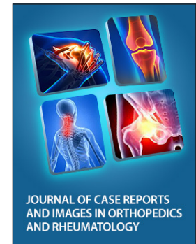
JOURNAL OF CASE REPORTS AND IMAGES IN ORTHOPEDICS AND RHEUMATOLOGY