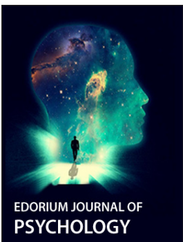
EDORIUM JOURNAL OF PSYCHOLOGY