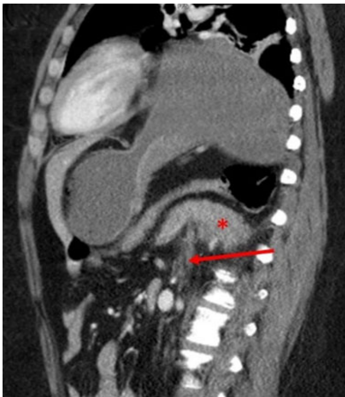
Figure 2: CT abdomen and pelvis with IV contrast sagittal view. Herniation of pancreatic tail above (shown in red asterisk) the left hemidiaphragm (marked in red arrow).