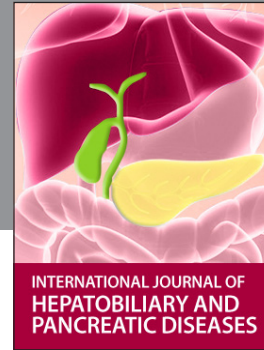
INTERNATIONAL JOURNAL OF HEPATOBIILIARY AND PANCREATIC DISEASES