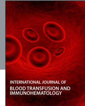
INTERNATIONAL JOURNAL OF BLOOD TRANSFUSION AND IMMUNOHEMATOLOGY