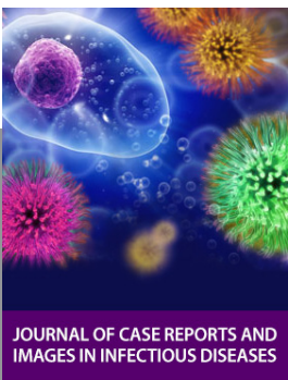
JOURNAL OF CASE REPORTS AND IMAGES IN INFECTIOUS DISEASES