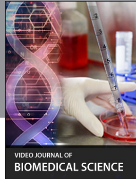
VIDEO JOURNAL OF BIOMEDICAL SCIENCE