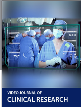
VIDEO JOURNAL OF CLINICAL RESEARCH