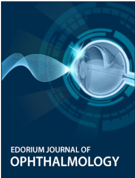
EDORIUM JOURNAL OF OPHTHALMOLOGY