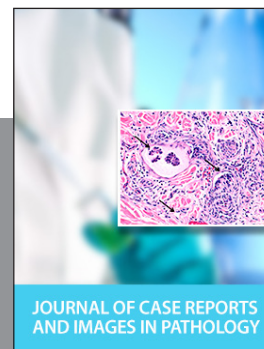
JOURNAL OF CASE REPORTS AND IMAGES IN PATHOLOGY