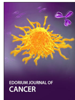
EDORIUM JOURNAL OF CANCER