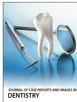
JOURNAL OF CASE REPORTS AND IMAGES IN DENTISTRY