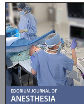
EDORIUM JOURNAL OF ANESTHESIA